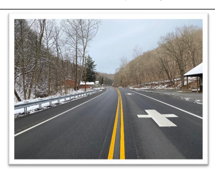
PA Turnpike Commission - Lindy Paving