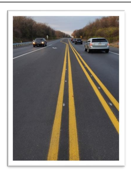
District 10 - Lindy Paving