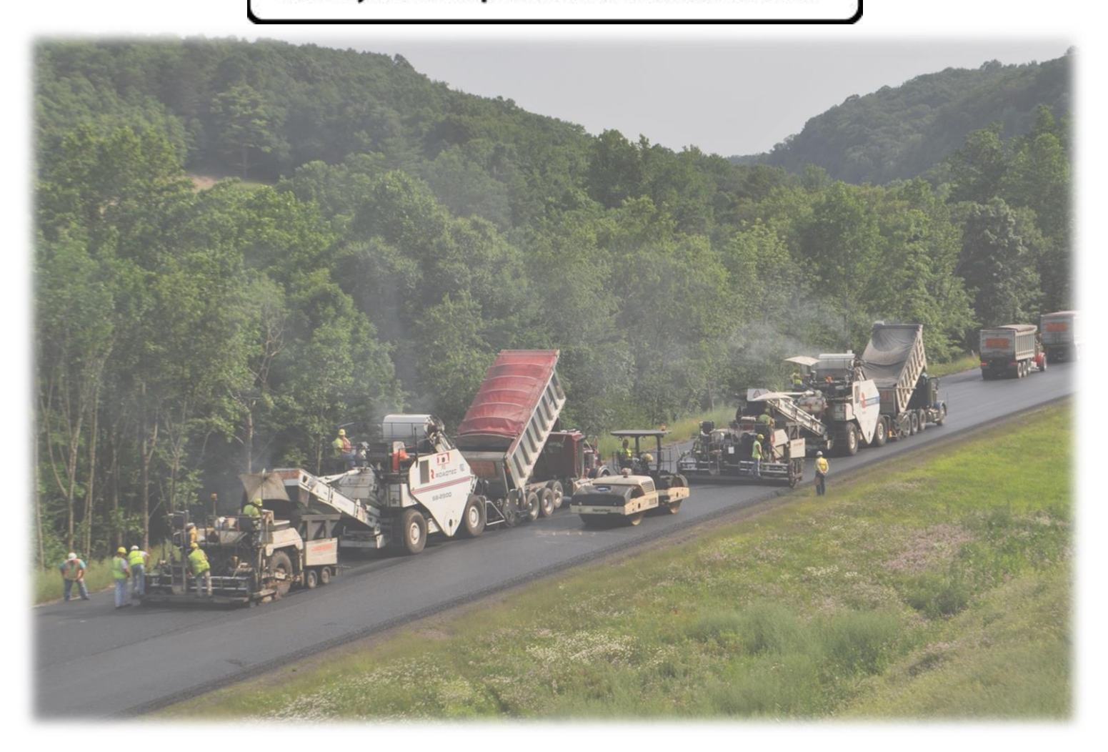
Registration Opens November 8, 2021

Pennsylvania Asphalt Pavement Association