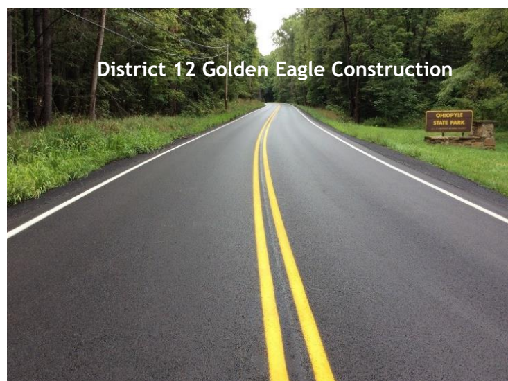
District 12 Golden Eagle Construction