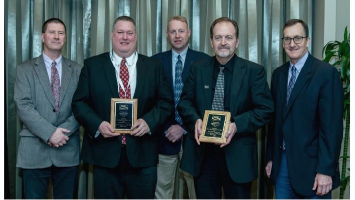
District 9 - New Enterprise Stone & Lime