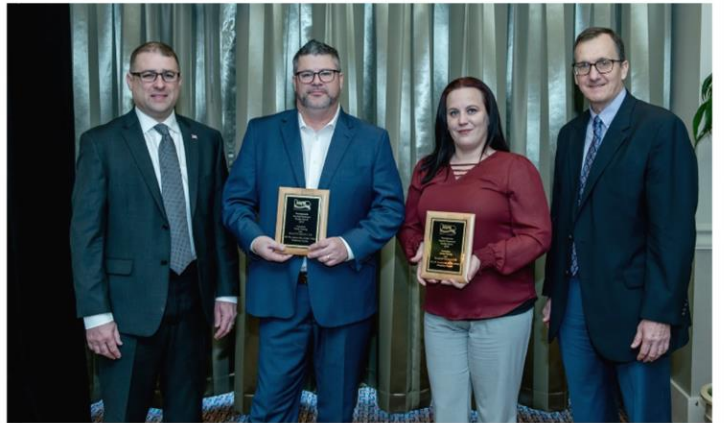
District 11 - Lindy Paving, Inc.