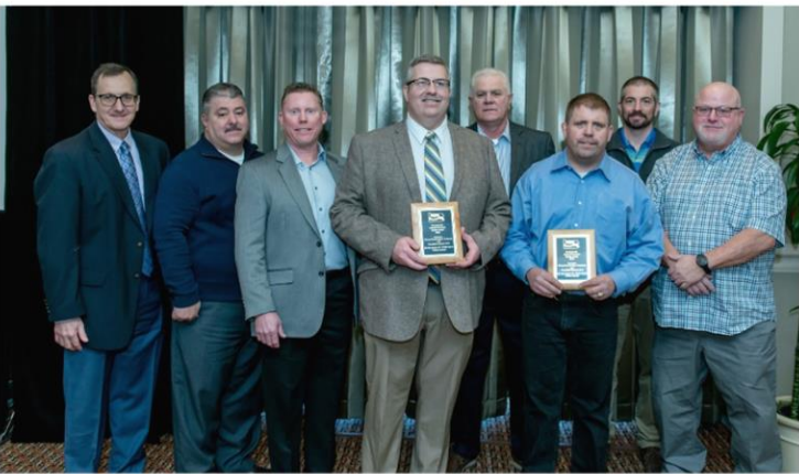
District 10 - Derry Construction Co.