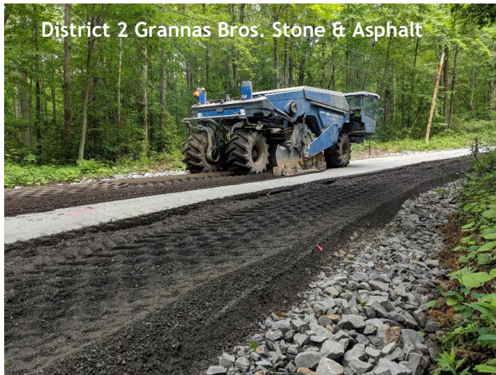
District 2 Grannas Bros. Stone & Asphalt