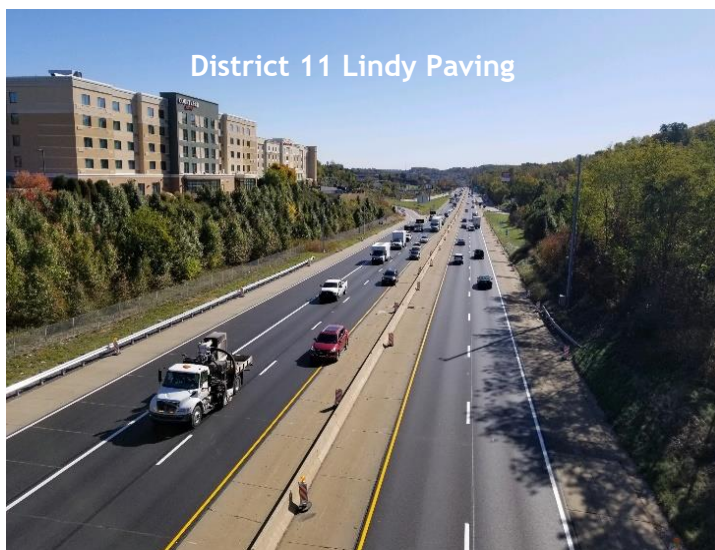
District 11 Lindy Paving