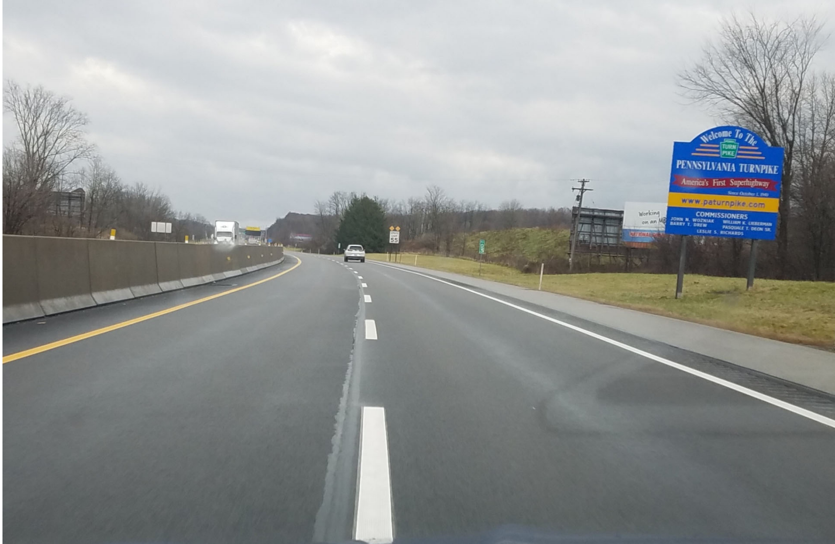
Pennsylvania Turnpike Commission, Lindy Paving