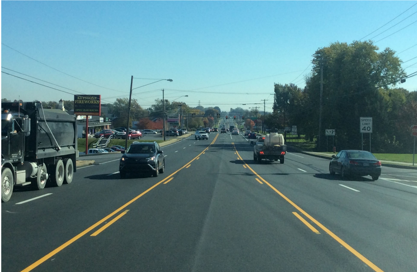
PennDOT District 8-0, New Enterprise Stone & Lime Co.