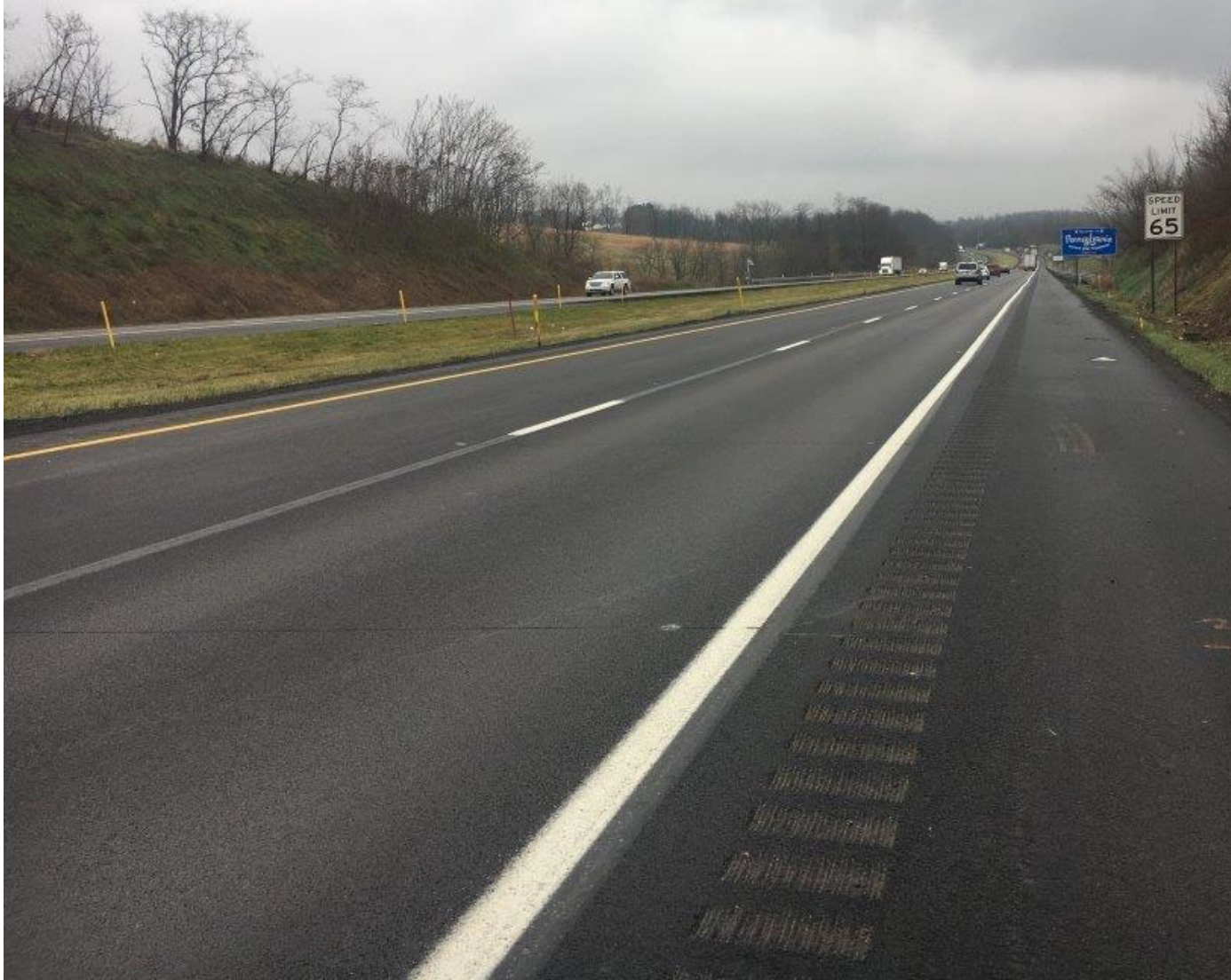
PennDOT District 12-0, Lane Construction