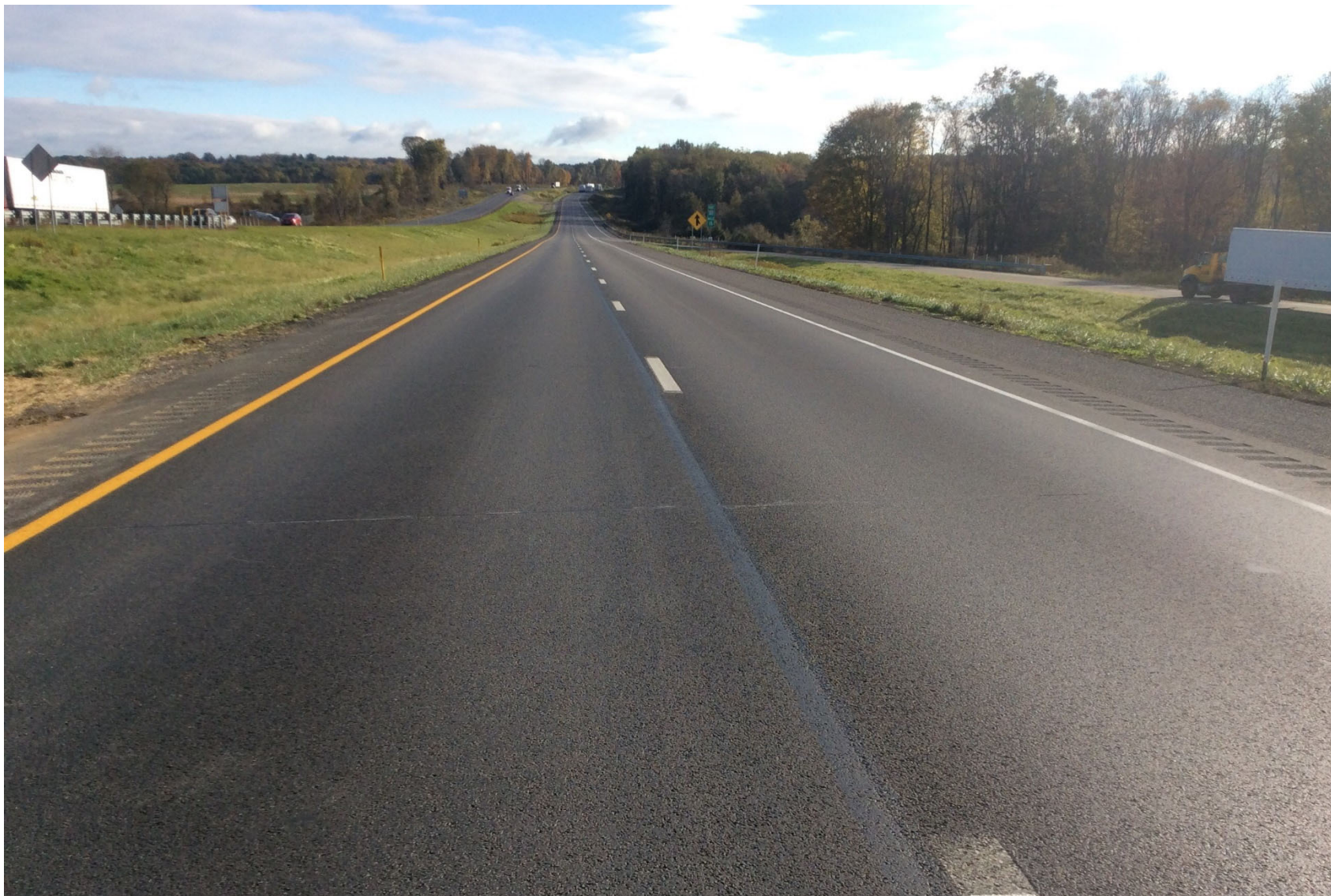
PennDOT District 1-0, Lindy Paving