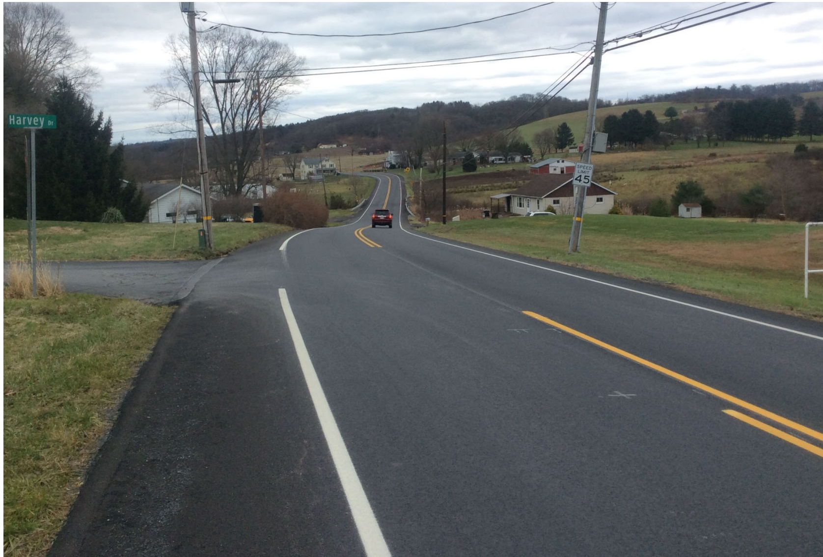
PennDOT District 5-0, New Enterprise Stone and Lime Co., Inc.