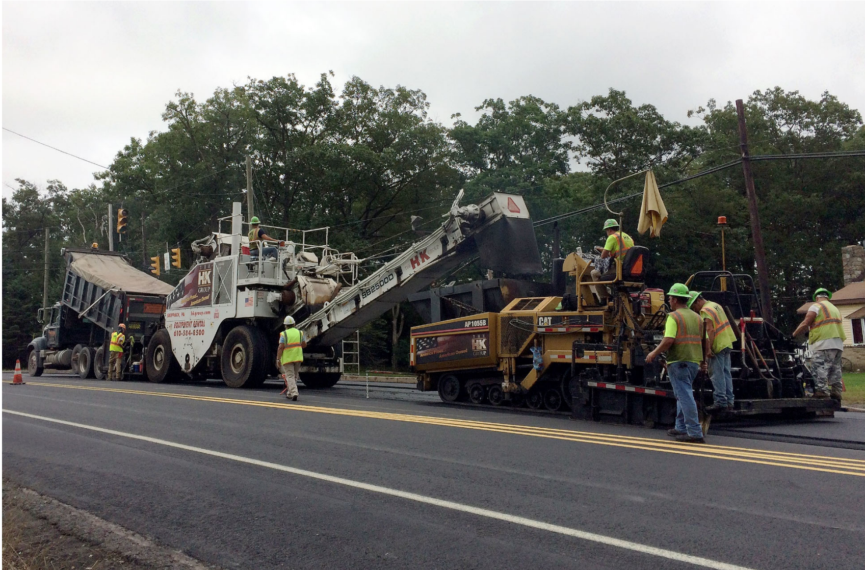
PennDOT District 4-0, The H&K Group