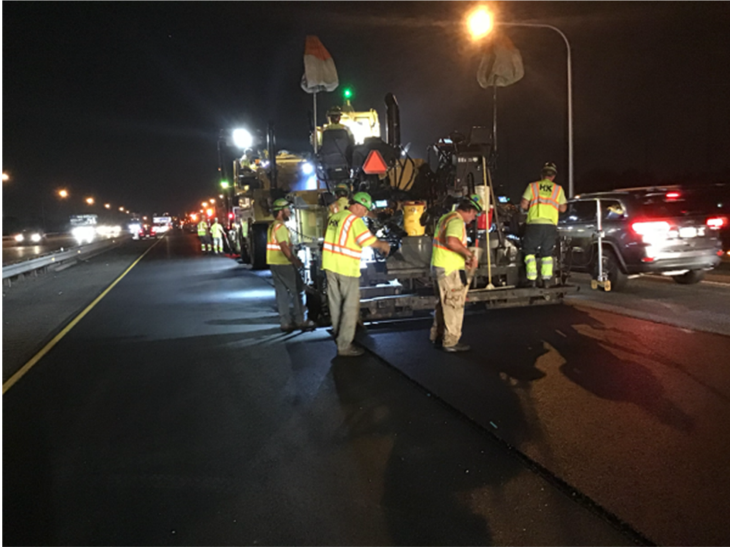
PennDOT District 6-0, The H&K Group