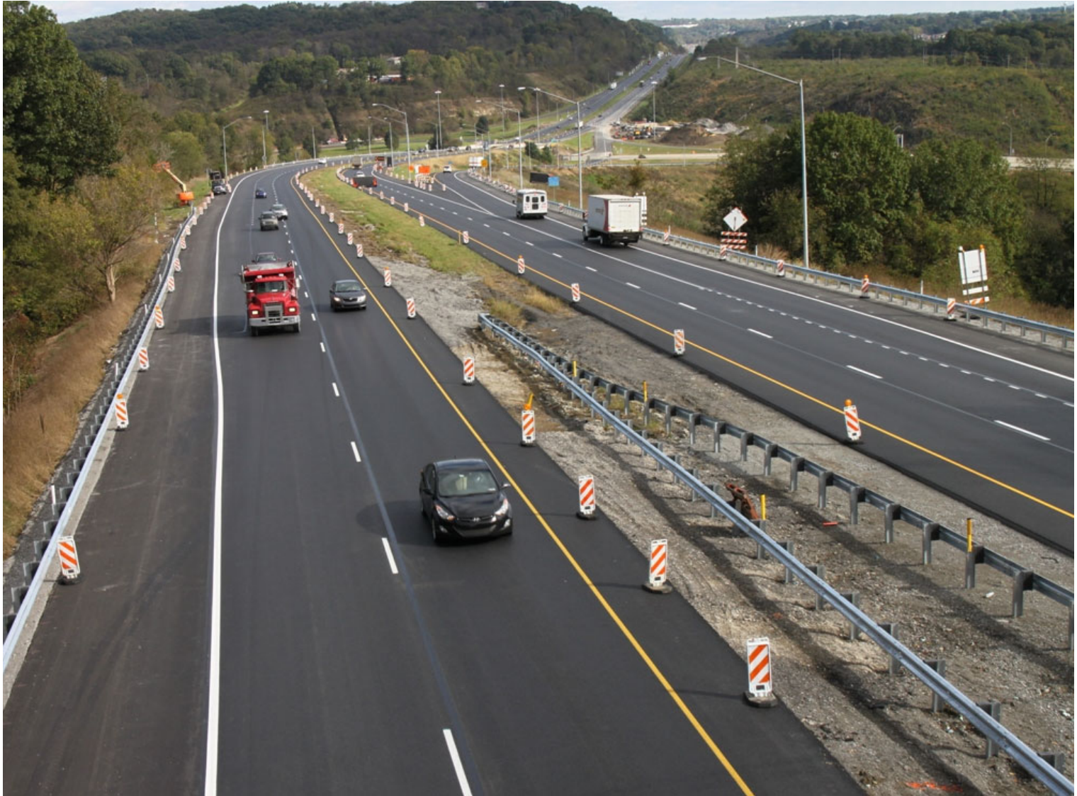
PennDOT District 11-0, Lindy Paving