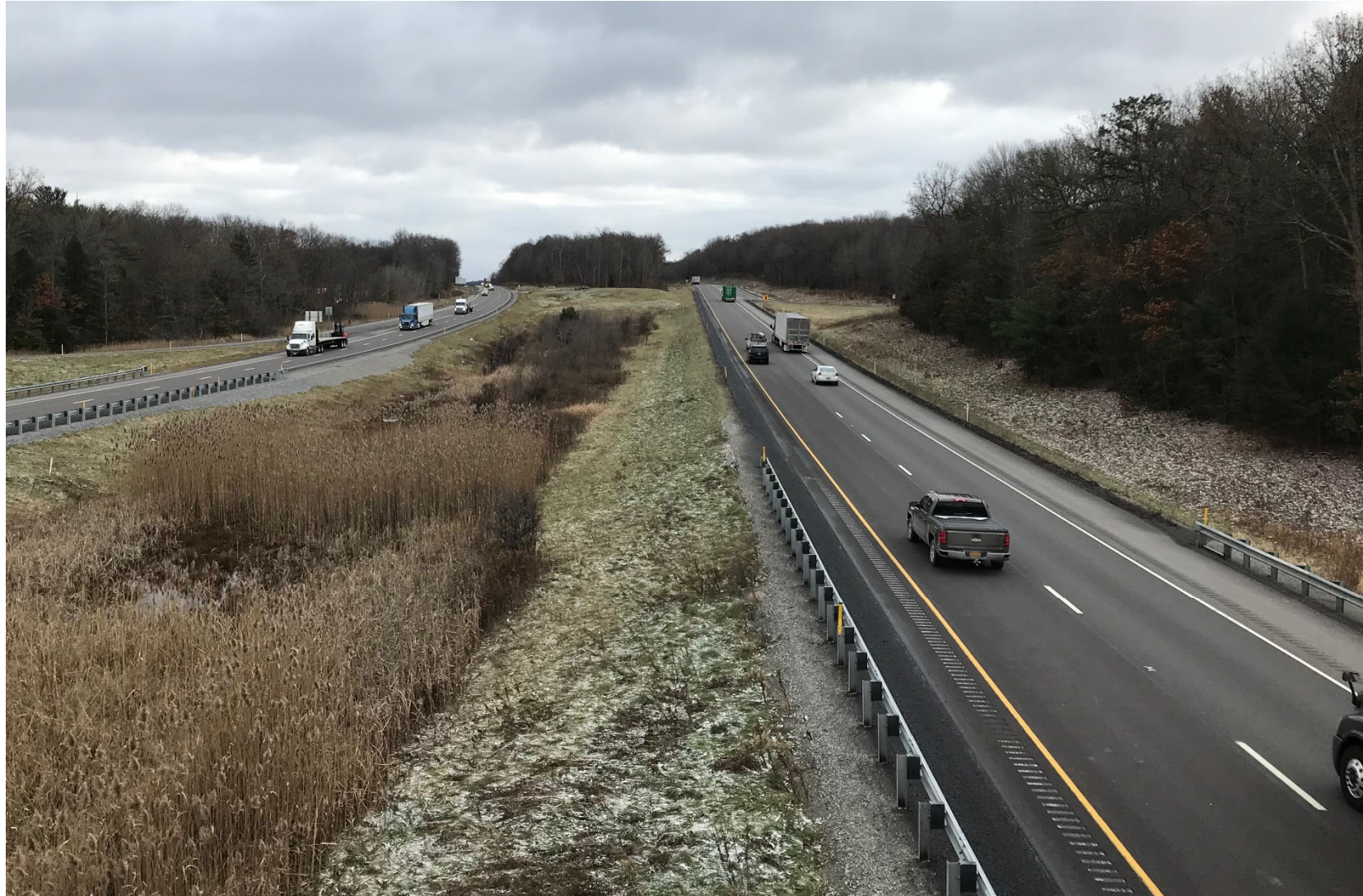
PennDOT District 2-0, HRI, Inc.