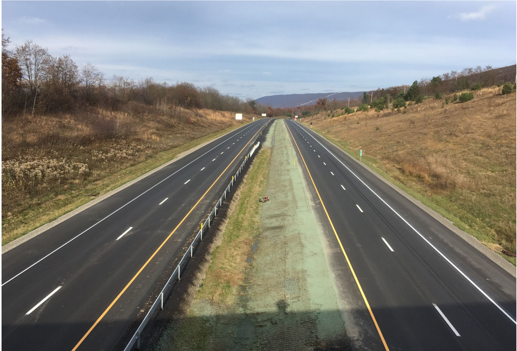
PennDOT District 9-0, Grannas Bros. Stone & Asphalt Co., Inc.