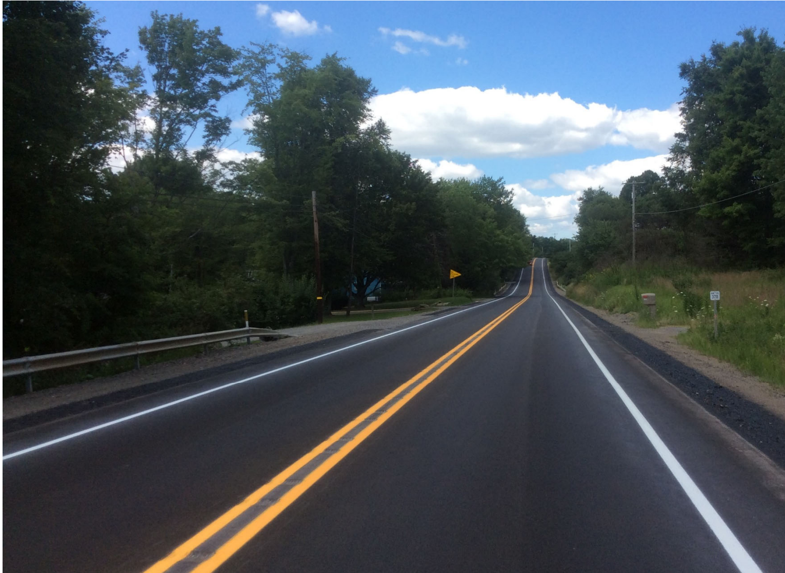
PennDOT District 10-0, Lindy Paving