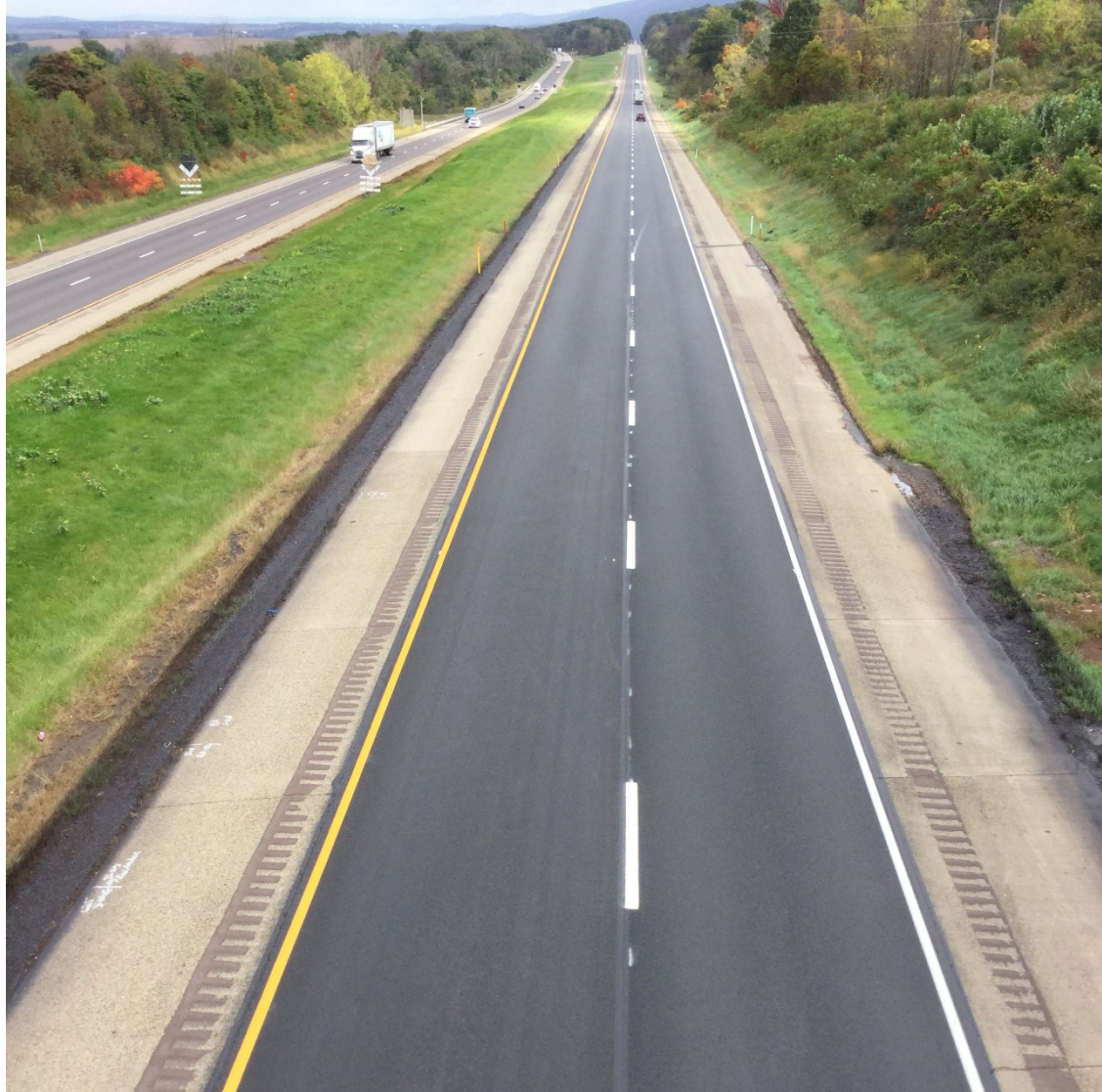
PennDOT District 3-0, Glenn O. Hawbaker, Inc.